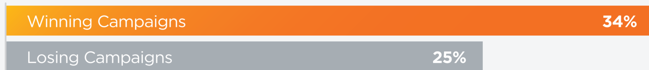
Percentage of Households Reached