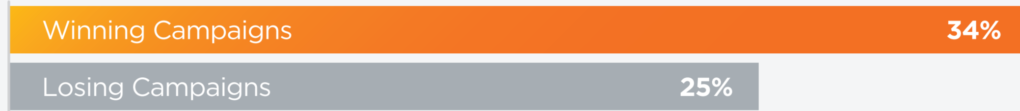
Cable TV Percentage of Total TV Ad Spend